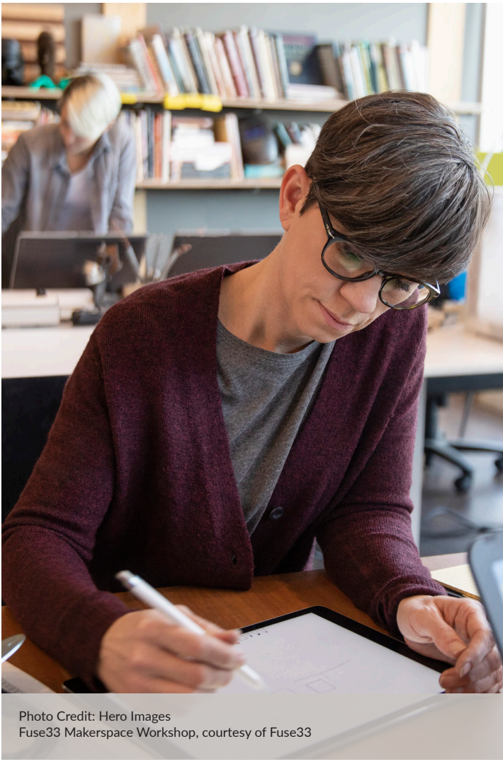
Fuse33 Makerspace Workshop